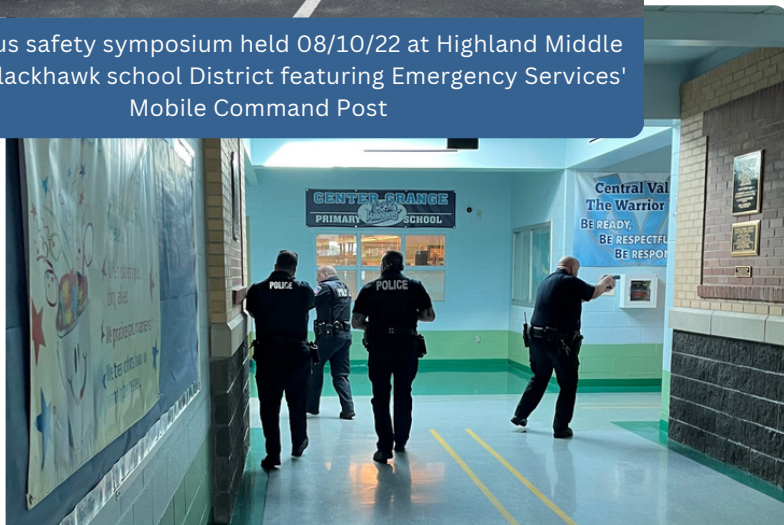
Exercises at Central Valley Center Grange Primary School on 08/23/22 for Center and Monaca Police and school staff