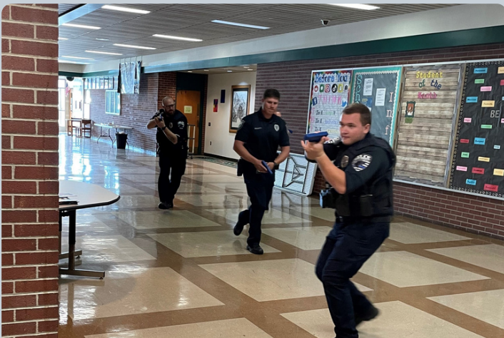
Riverside Active Shooter and Stop the Bleed Training, 10/10/22