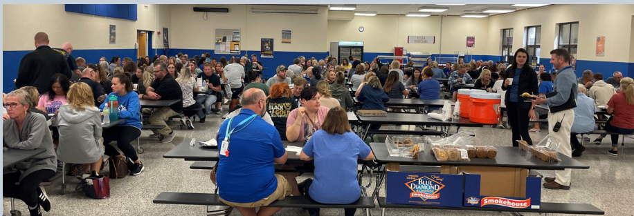
Ellwood City High School Active Shooter Training and Exercise day, 09/02/22