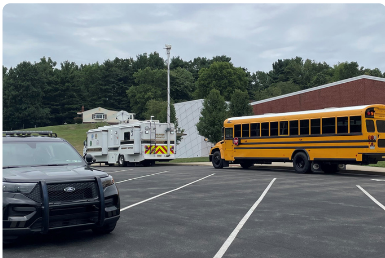
School bus safety symposium held 08/10/22 at Highland Middle School, Blackhawk school District featuring Emergency Services' Mobile Command Post

Beaver County Emergency Services continues to partner with the County District Attorney's Office, Sheriff's Office and ESU Team to present Active Shooter Training and Exercises as well as Stop the Bleed Training for school districts and local law enforcement agencies. Included below and on the following page are scenes from recent training and exercise events. Not pictured are presentations and trainings held at Midland Innovative Technology Charter School on August 23 and Western Beaver School District on August 25.