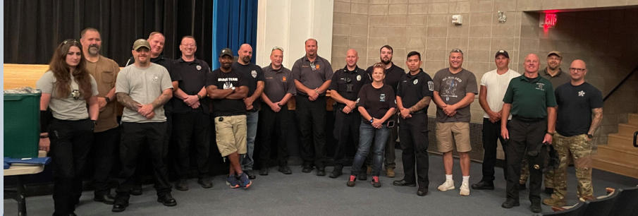
RAIDER (Rapid Deployment) Training on 08/18/22 For Law Enforcement in Active Shooter Incidents Presented by local LE instructors at Rochester High School