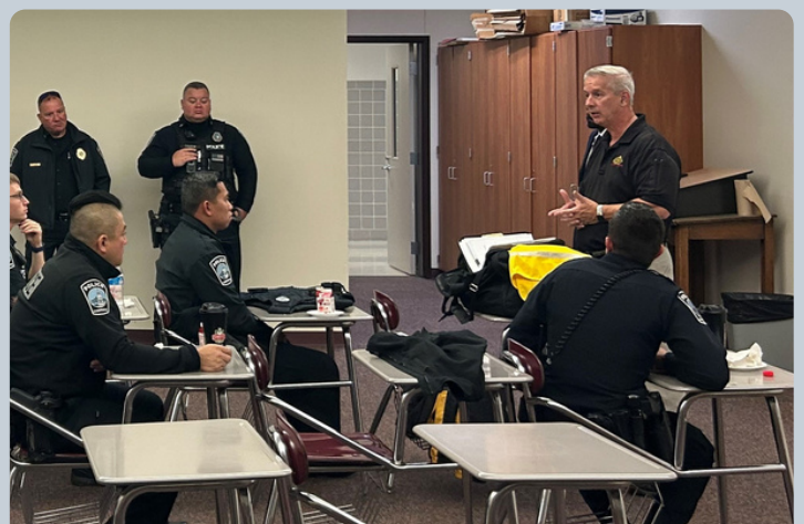
Police briefing at Ambridge High School Active Shooter review & exercise on 10/28/22