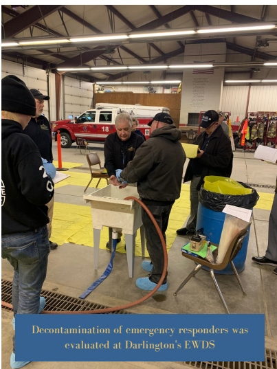
Decontamination of emergency responders was evaluated at Darlington's EWDS