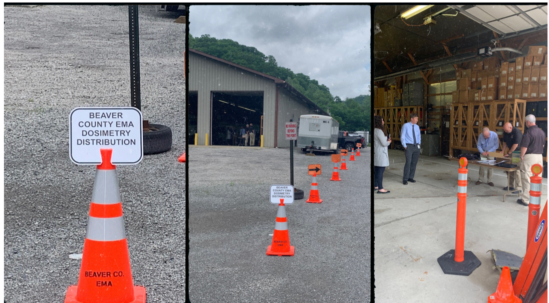
On exercise night, staff demonstrated the county's ability to distribute dosimetry equipment to municipal responders. A drive through system was set up at the Beaver County Hazmat Garage, and municipal volunteers simulated pick up of radiological response equipment by picking up lunches for their staff.