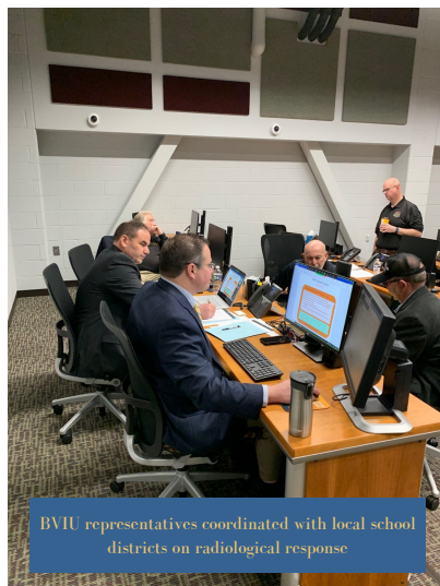
BVIU representatives coordinated with local school districts on radiological response